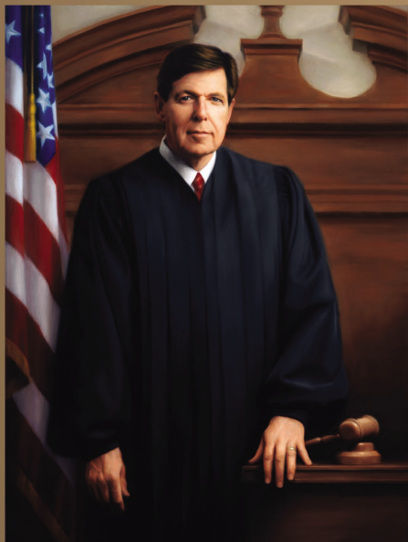
Judge William Downes, United States 10th District Court, 40" x 30"

- The Honorable Gary Locke, former United States Secretary of Commerce, U.S. Ambassador to China and Governor of Washington State