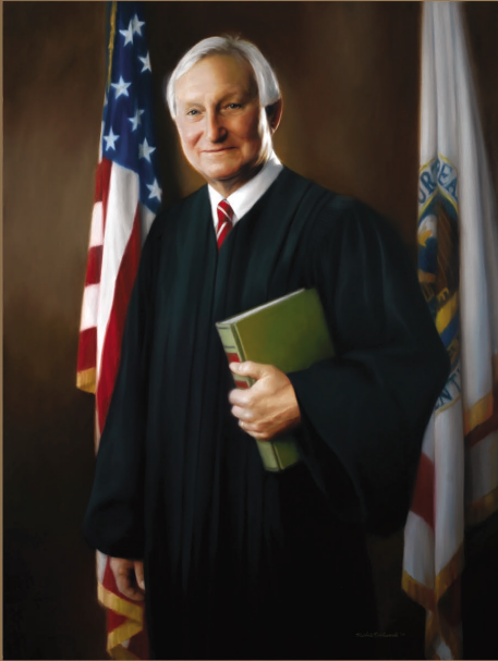
Joel Dubina, Chief Justice, United States 11th Circuit Court, 48" x 36"