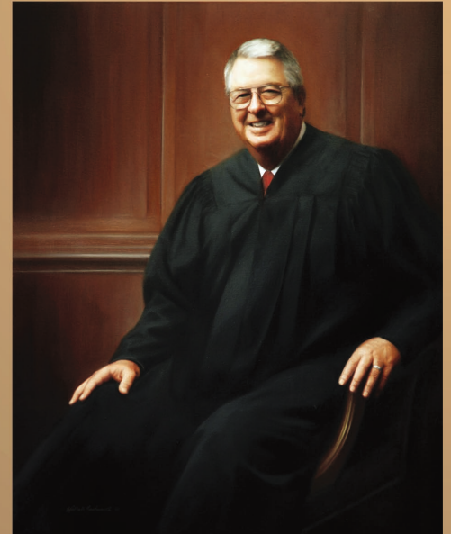
Judge Sam Sparks, United States 5th District Court, 38" x 32"